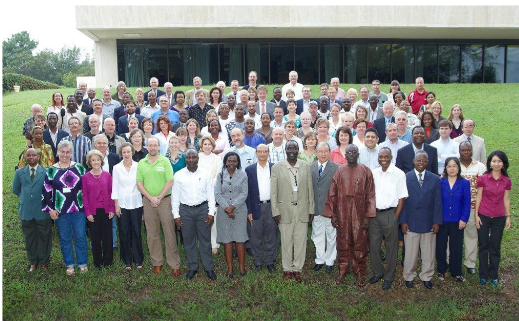
Figure 4: A representative sample of the IFDC team.

Increasingly, IFDC's fertilizer development work will be conducted through the Virtual Fertilizer Research Center (VFRC), a research initiative established by IFDC in 2010. Initial research efforts have started, including on the use of phosphate rock as direct application to reduce processing losses and cost, on low-cost, slow-release nitrogen fertilizers, on fertilizers containing micronutrients, and on multi-nutrient fertilizer from municipal sewage sludge.