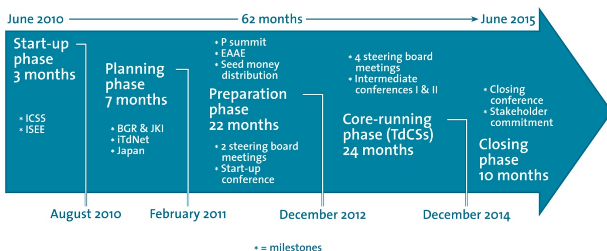
Figure 5: The project timeline including milestones.

The Global TraPs project involves mutual learning processes on sustainable P management among science, industry and other stakeholder groups, resulting in socially robust knowledge for future P management. Numerous case studies addressing critical questions of P in all supply nodes will contribute knowledge and information to the global P discussion. In itself, the transdisciplinary learning processes of Global TraPs will build capacity at local and global scales; therefore, an important product of the Global TraPs project is the process itself.